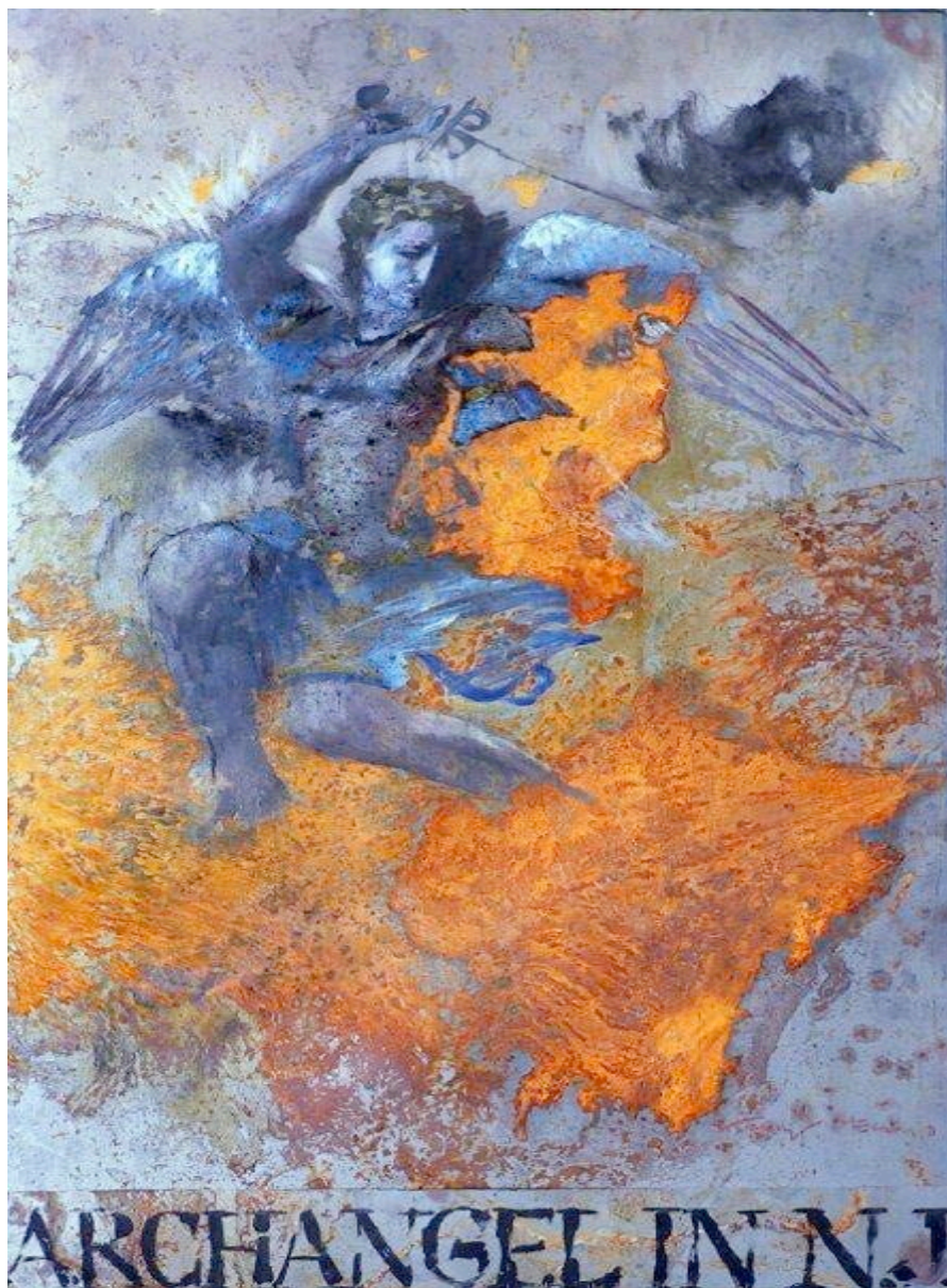
“Michael the Archangel in New Jersey” Komar and Melamid

Hours: Tuesday – Saturday 10:00 to 5:00 Sunday 1:00 to 5:00 www.biblicalarts.org