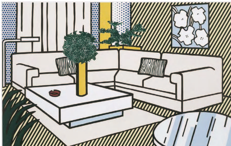
"Interior Series: Yellow Vase" 1991 Lithograph, Woodcut and Screen Print Roy Lichtenstein