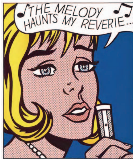
"Reverie" 1965 Screen Print Roy Lichtenstein