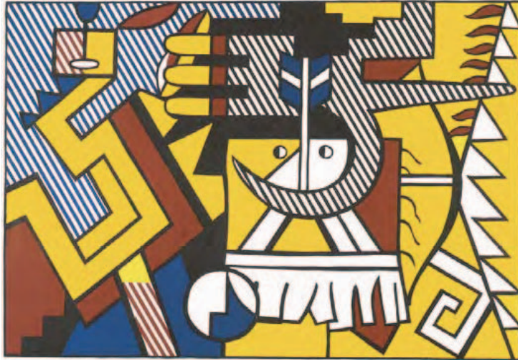
"American Indian Theme VI" 1980 Woodcut Roy Lichtenstein