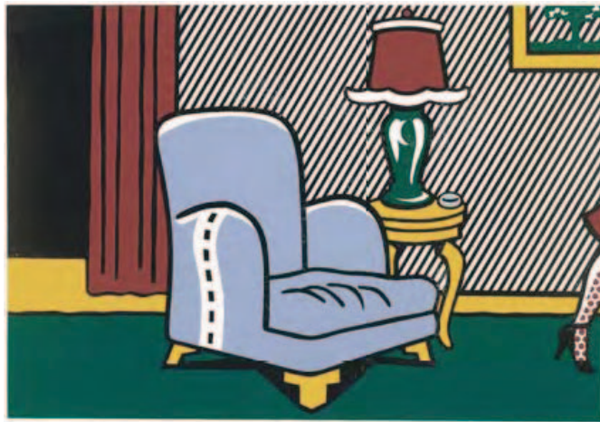
"Interior Series: La Sortie" 1990 Woodcut Roy Lichtenstein